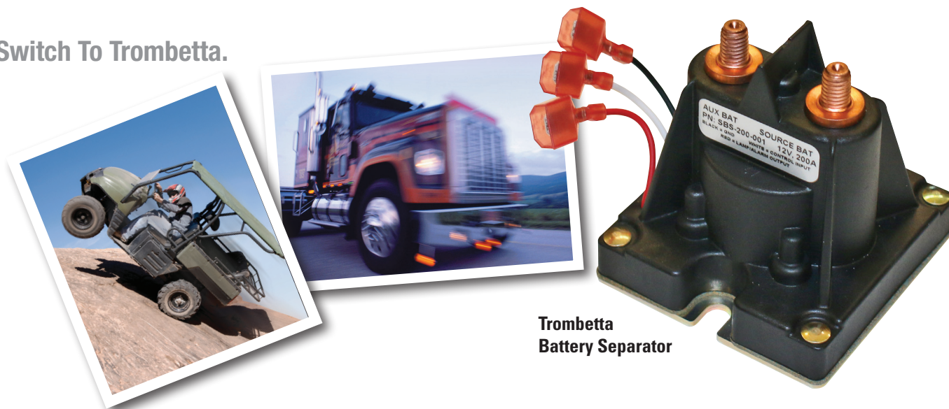
Trombetta Battery Separator